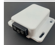
6094-PWDC-W : Cerakote® Satin White milled-aluminum