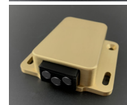
6094-SB : Satin Brass (lacquered)