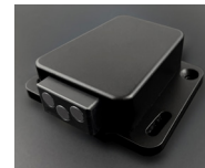
6094-AALUBLK : Anodized Matte Black milled-aluminum