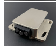
6094-SN : Satin Nickel plated brass