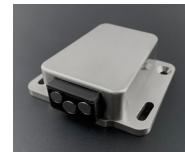
6094-AALUCL : Clear-Anodized aluminum